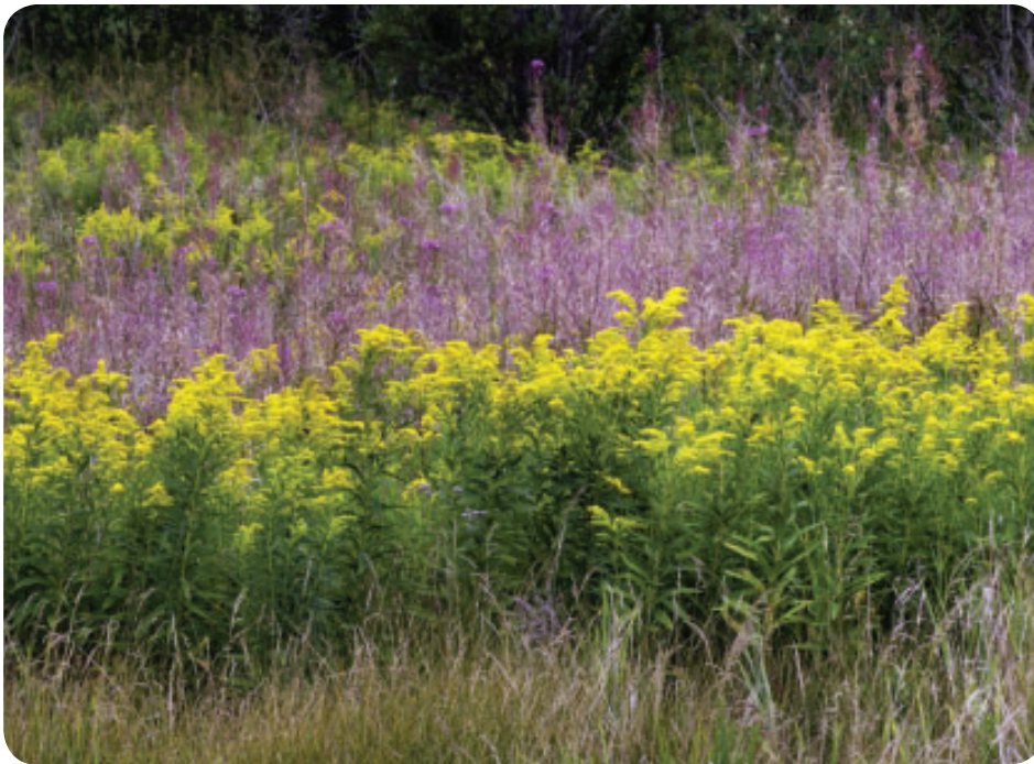
Figure 3 All these plants are competing for the same resources.

competition: occurs when more than one organism tries to obtain the same basic resources in the same habitat